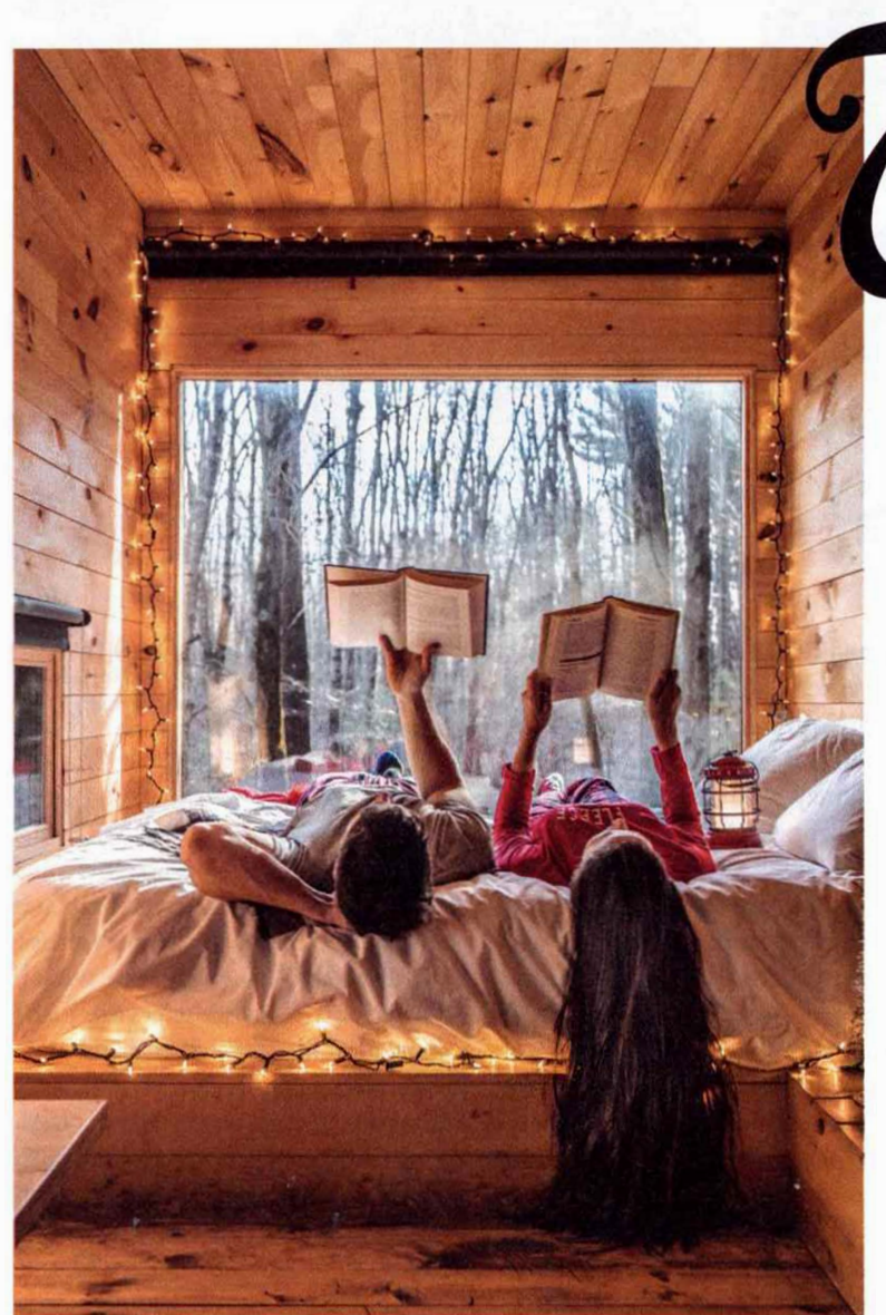
Tiny cabins equipped with all the essentials and scattered across acres of rural landscape are the specialty of vacation rental company Getaway, whose New Hampshire location is just a few miles from Bear Brook State Park.

rite your love story's next scene in a setting as fresh as just-fallen snow at these new or recently reimagined properties, where a dash of the unexpected turns a weekend away into a romantic odyssey.